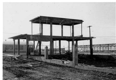
New Base Theater under construction