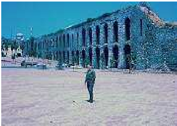
Old Aqueduct on outskirts of Istanbul