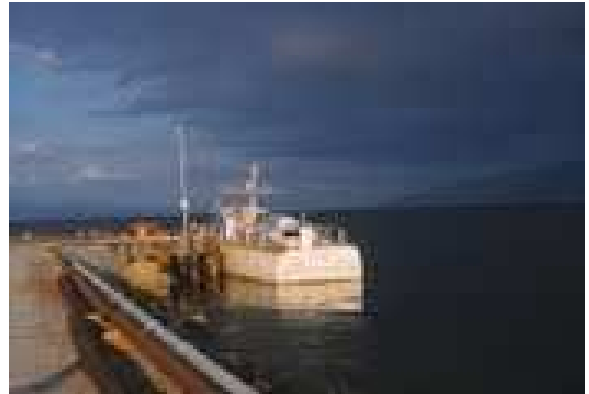
Navy Boat at the KAS dock