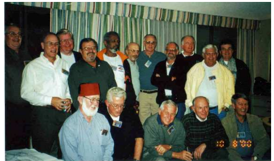
Original Crew 1 st Reunion 2000