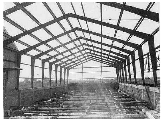
New Bowling alley under construction