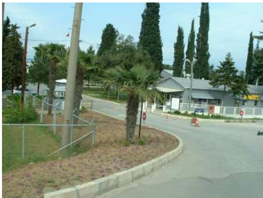
Karamursel Air Station Main Gate 2006