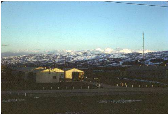
Snow on the hills across from Mudsite