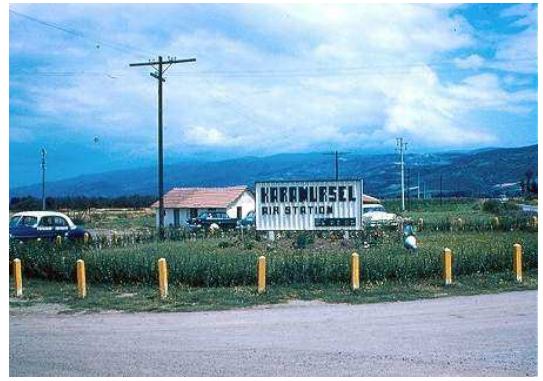
Sign outside the Main Gate at KAS 1958