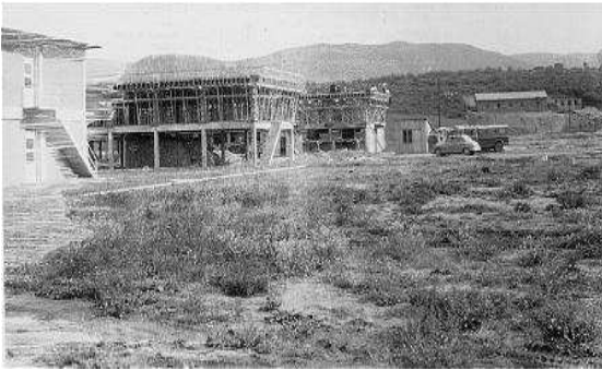
Two navy barracks under construction